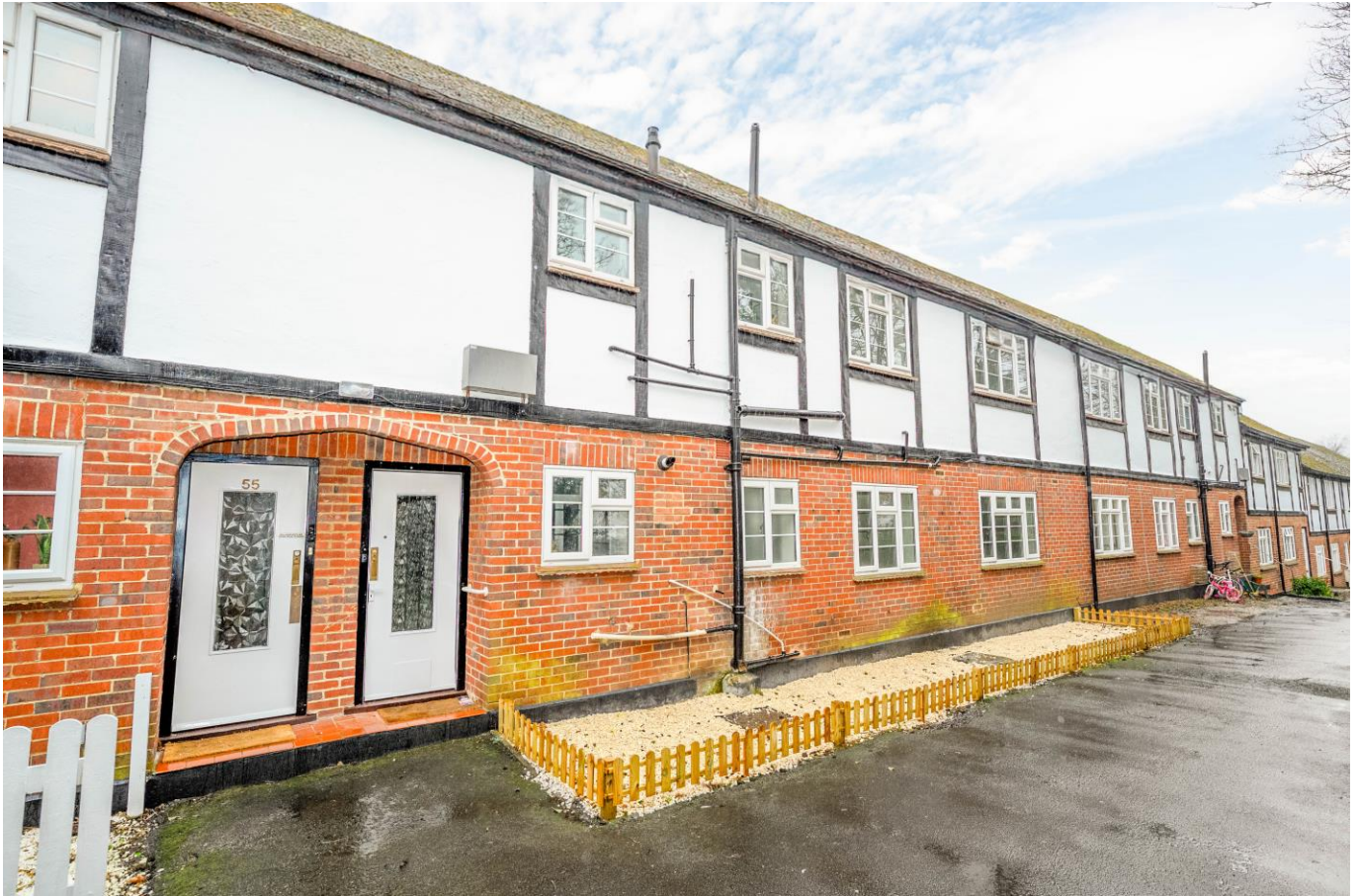
56 Arlington Lodge Weybridge Surrey KT13 8RD